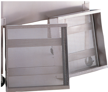
M00371 CAPPINGS BASKETS