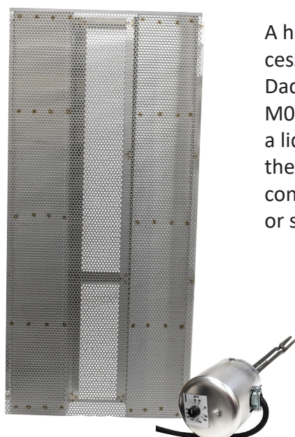
M00372 GRID (FITS INSIDE THE M00370)

A heater and support accessory that allows the Dadant Cappings Tank M00370 to be used also as a liquefier. As a liquefier, the tank holds 3-60 pound containers of honey, round or square.