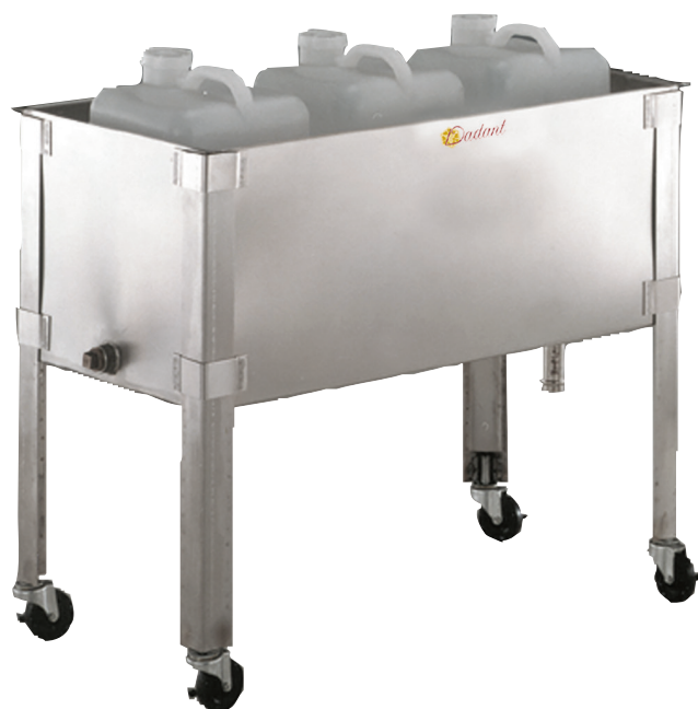
M00370 CAPPINGS TANK

A heater and support accessory that allows the Dadant Cappings Tank M00370 to be used also as a liquefier. As a liquefier, the tank holds 3-60 pound containers of honey, round or square.