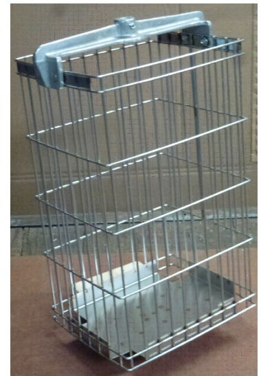
Stainless steel wire basket